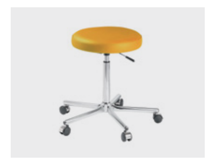
Physician's chair – height-adjustable, manual locking