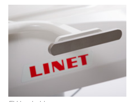
EU bar holder