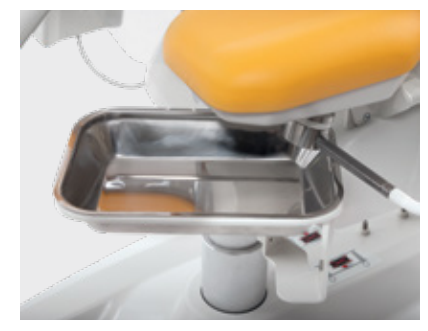
Stainless steel bowl