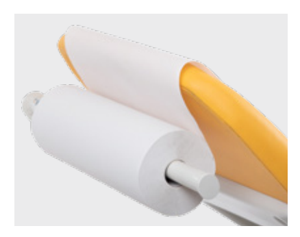
Papper roll holder (standard)