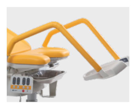
Leg supports with upholstery