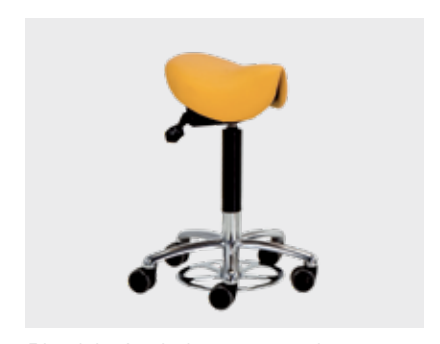
Physician's chair – ergonomic, adjustable feet