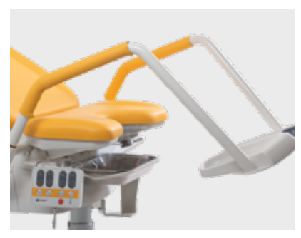
Leg supports with partial upholstery