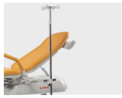
Infusion stand holder