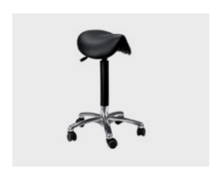
Physician's chair – ergonomic, height-adjustable, manual locking